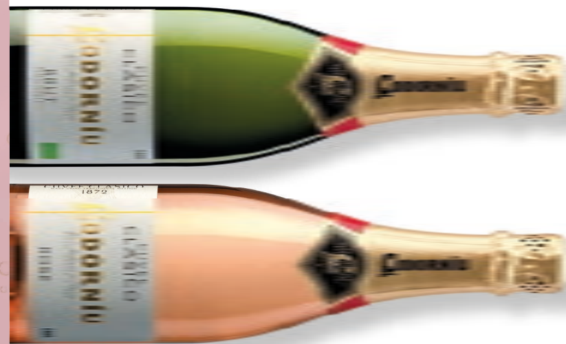
Codorniu Classic Cuvée Brut 75cl, Rosé 75cl