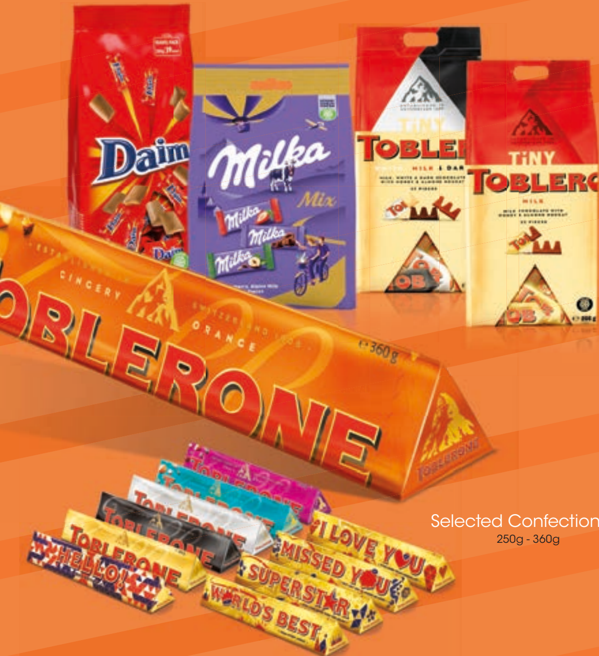
Selected Confectionery 250g - 360g