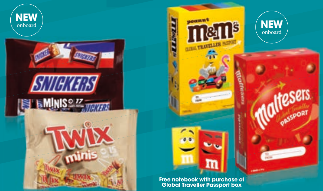
Selected Confectionery Minis 333g