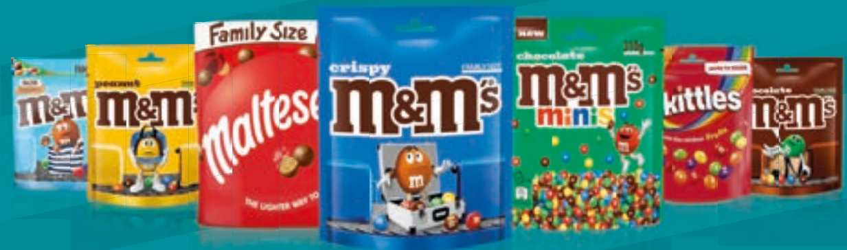
Selected Confectionery Pouches 273g - 330g