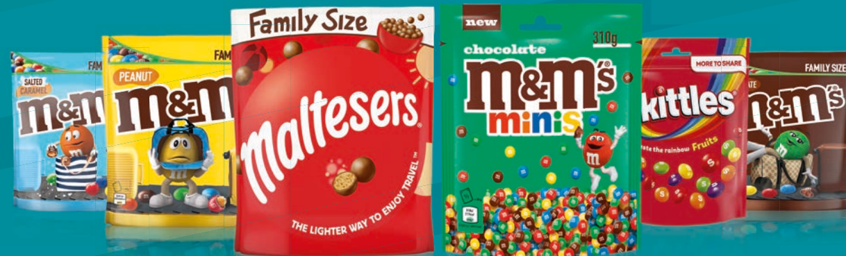
Selected Confectionery Pouches 273g - 330g