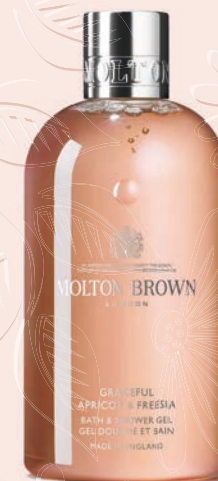
Bath & Shower Gel Graceful Apricot & Freesia. 300ml £20 Save £5*