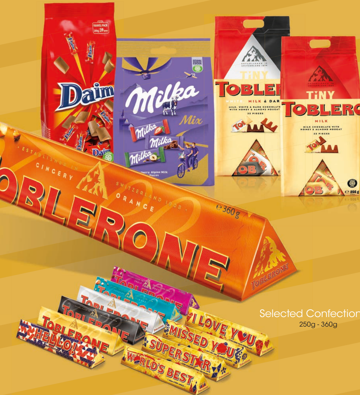
Selected Confectionery 250g - 360g