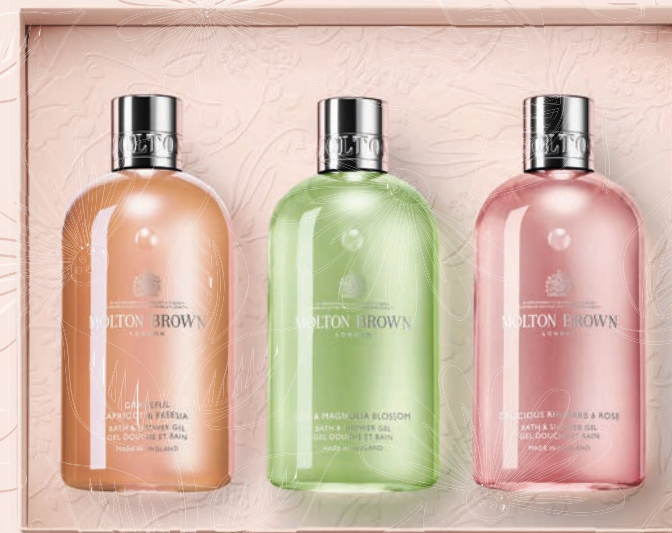
Bath & Shower Gel Trio Set Graceful Apricot & Freesia, Lily & Magnolia Blossom, Delicious Rhubarb & Rose. 3 x 300ml £45.50 Save £19.50*