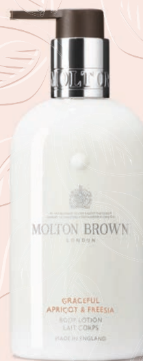
Body Lotion Graceful Apricot & Freesia. 300ml £24 Save £6*