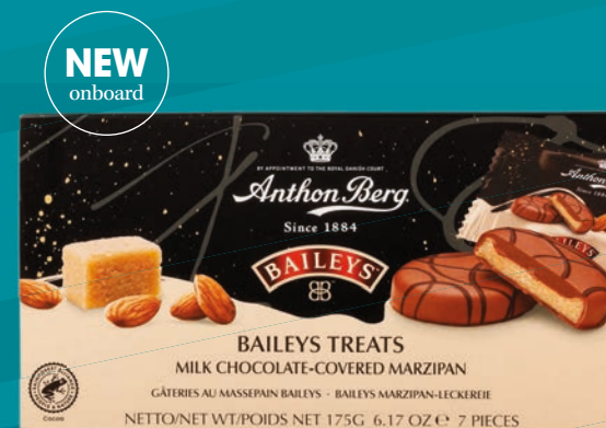
Selected Anthon Berg 175g - 220g