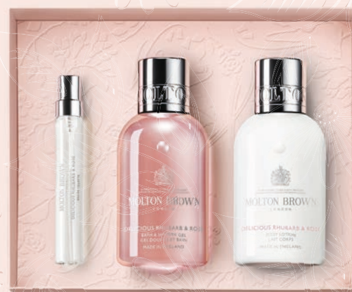
Fragrance Layering Set Set includes: Delicious Rhubarb & Rose 7.5ml EDT, 100ml Bath & Shower Gel, 100ml Body Lotion. £19.60 Save £8.40*