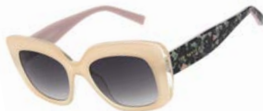
Hattie Milkie Pink £60 Save £15*