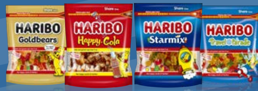
Selected Haribo Confectionery Bags 220g - 250g