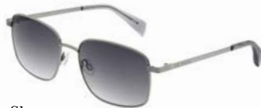
Shaun Light Gun £60 Save £15*