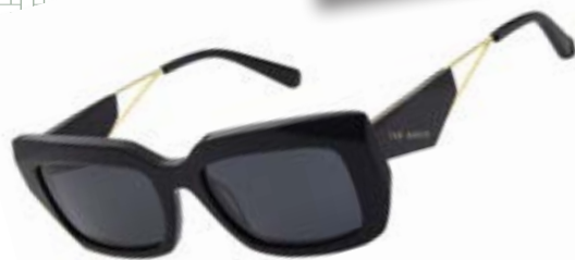
Marcie Black £99.99 Save £30*