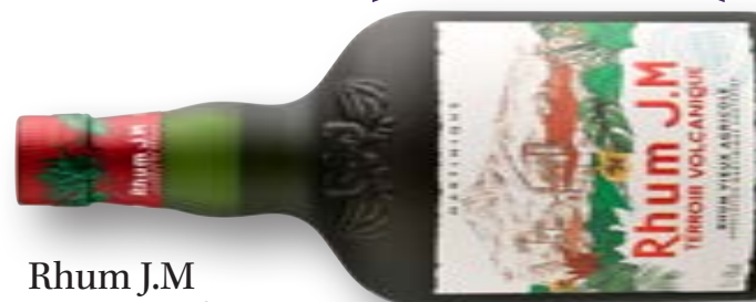
Rhum J.M Terroir Volcanique 70cl £21.99 Save £6.80*

The number 1 rum brand in both Martinique and France