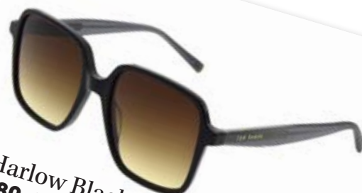
Harlow Black £80 Save £20*