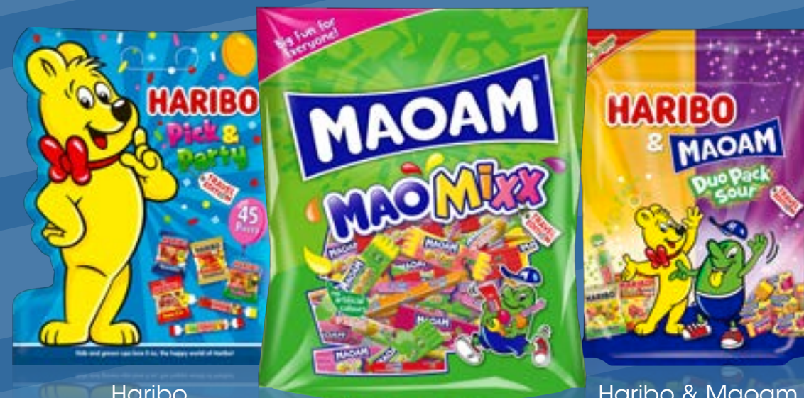
Haribo Pick & Party 748g £9.99