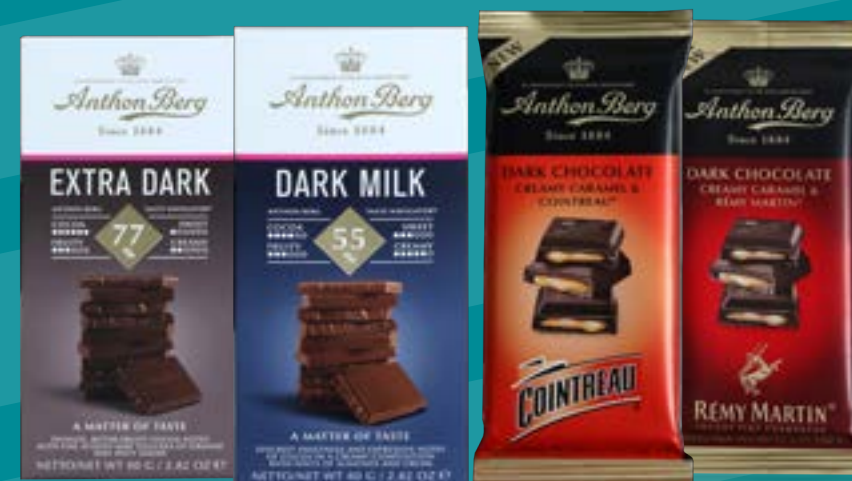
Selected Anthon Berg Chocolate Bars 80g - 90g