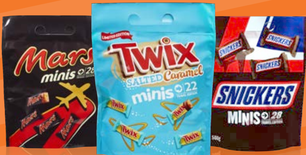
Selected Minis Confectionery Pouches 440g - 500g

SPEND £12 ON HARIBO GET A FREE HARIBO GOLD BEAR PLUSH