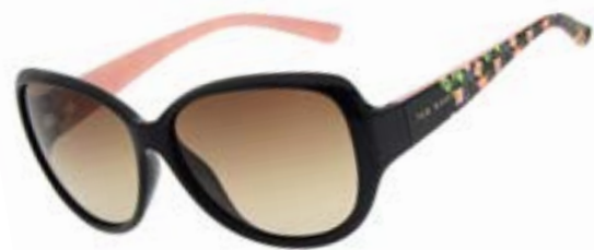
Shay Black Pink £60 Save £15*