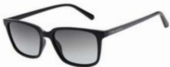
Roman Black £80 Save £20*