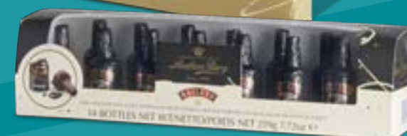
Selected Anthon Berg Liqueurs 130g - 219g

Offers subject to availability for a limited period only on selected ships and while stocks last.