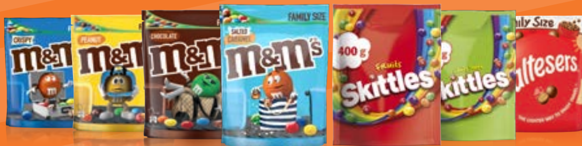
Selected Confectionery Bags 300g - 440g