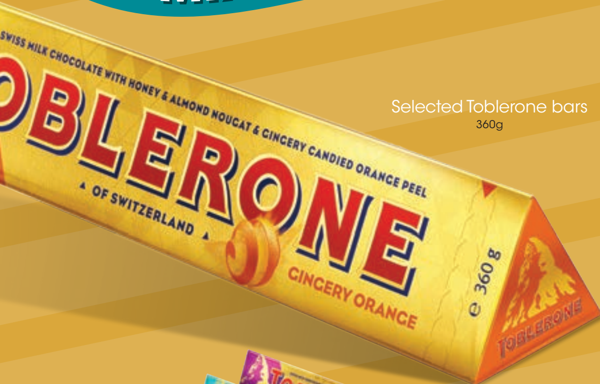
Selected Toblerone bars 360g